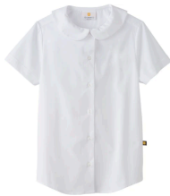
Peter pan collared short-sleeve