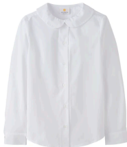
Peter pan collared long-sleeve

*Jumper must be worn with the peter pan blouse, not a polo shirt