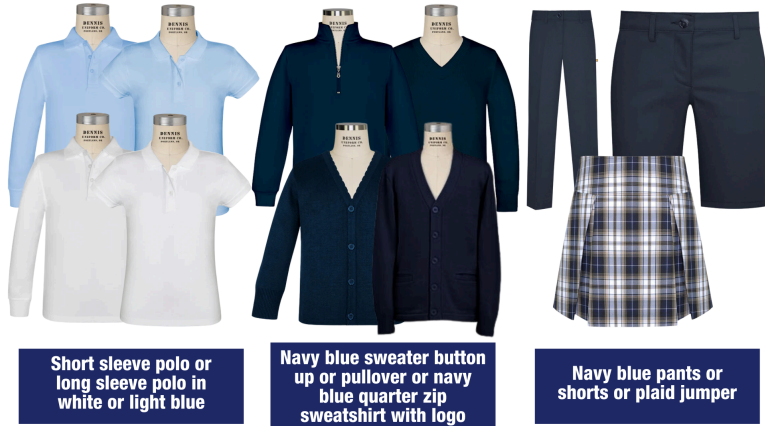
Short sleeve polo or long sleeve polo in white or light blue